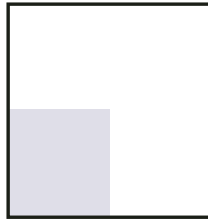
QUARTER PAGE 4.875"w x 7"h